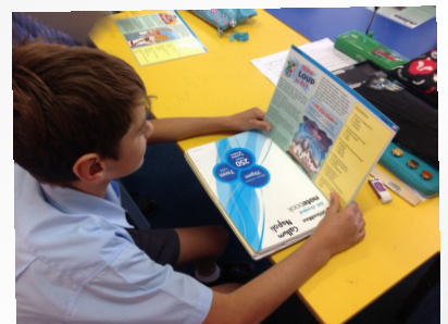
READING AND WRITING