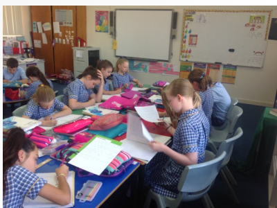
WE NEVER STOP LEARNING