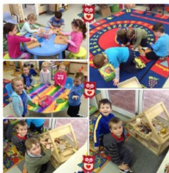
We're all happy little vegemites down in Kindy!