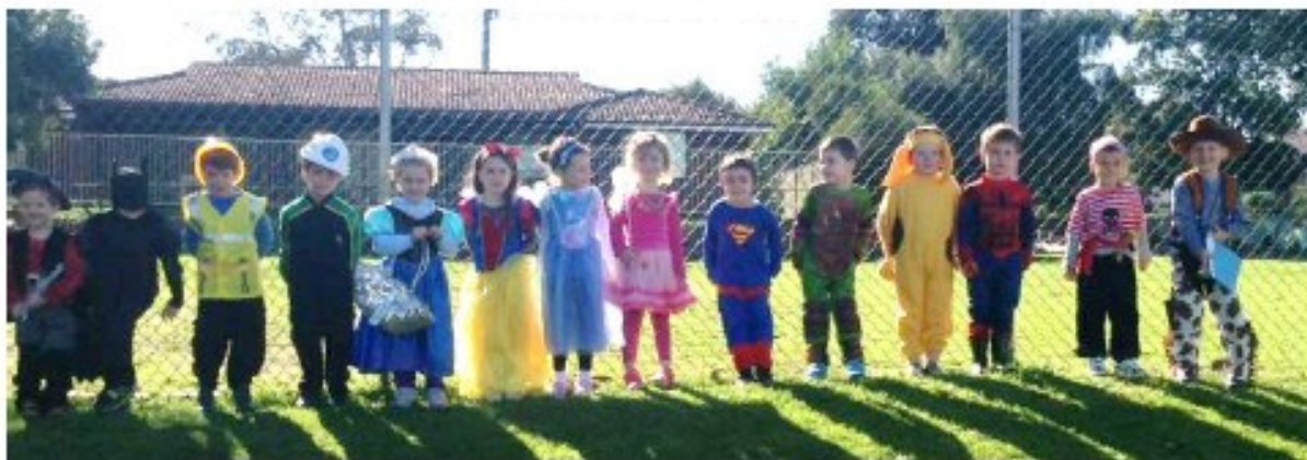
Book Week Dress Up Day