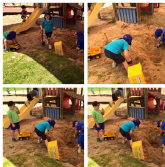
Digging a Dam for the letter Dd