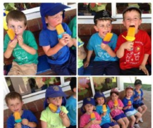
We squeezed our own Oranges to make juice and froze it to make icy poles!