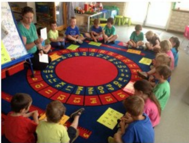
Bingo (or 'Dingo' as some of the Kindies call it!) is one of our favourite games!