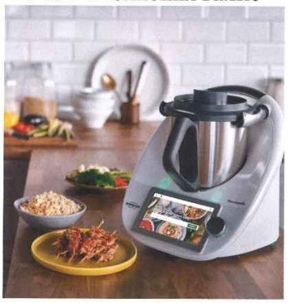
Only 200 tickets available! Drawn 11th September at the Bingo Night Win a Thermomix TM6 valued at $2359