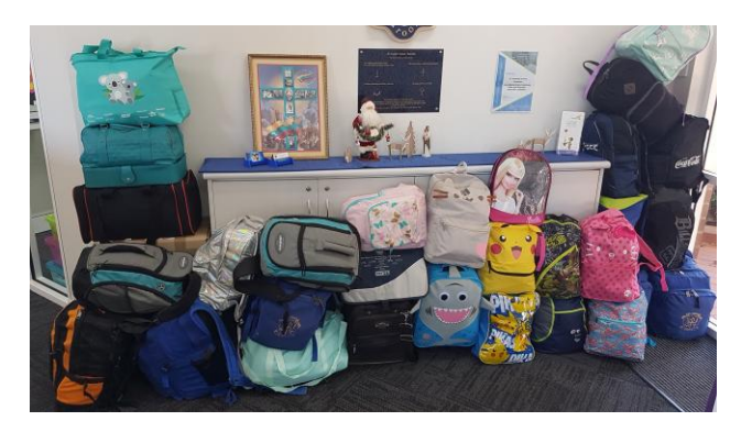
1 - Thank you to all the families that took the time to donate towards this very worthy project. These packages will be heading overseas to students less fortunate than our own. Spreading the MJR spirit!

St Joseph's Waroona have decided to partner with 'Uniform Rescue'. This worthy organisation collects unwanted school uniforms from schools around Western Australia, which are then donated to schools and communities overseas who can give the uniforms a second life.