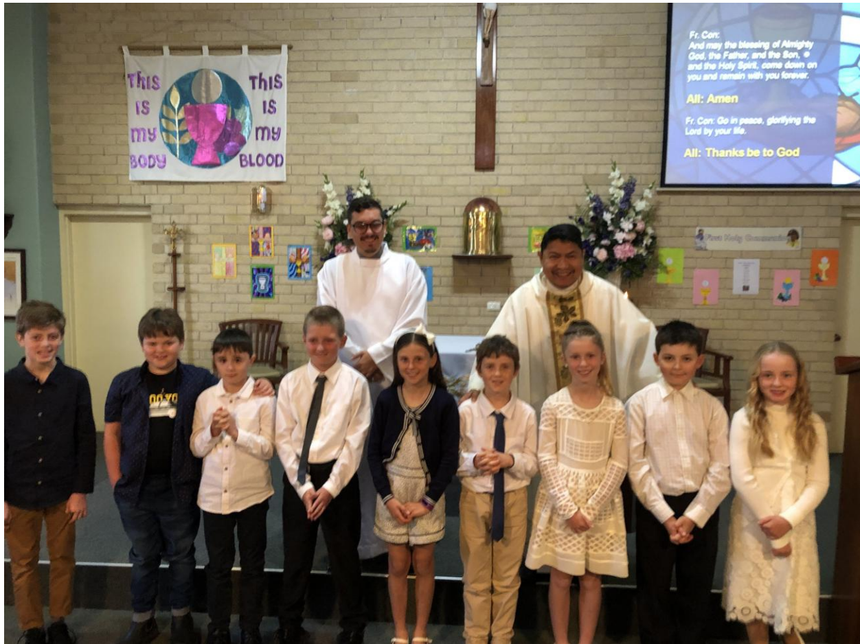
3 - Holy Communion 2020