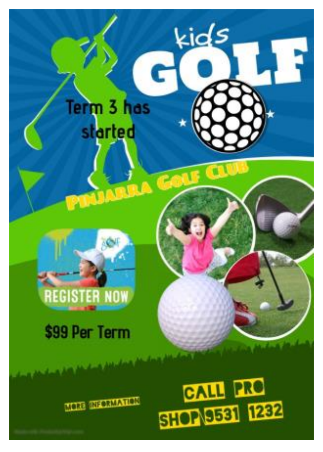
1 - Pinjarra Golf Days